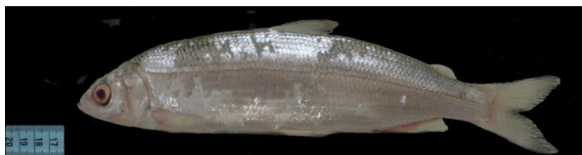
Figure 2. Coregonus albula from Lake Aktaş, Turkey, female, 257 mm in Standard Length (HUIC-ARA-7519)