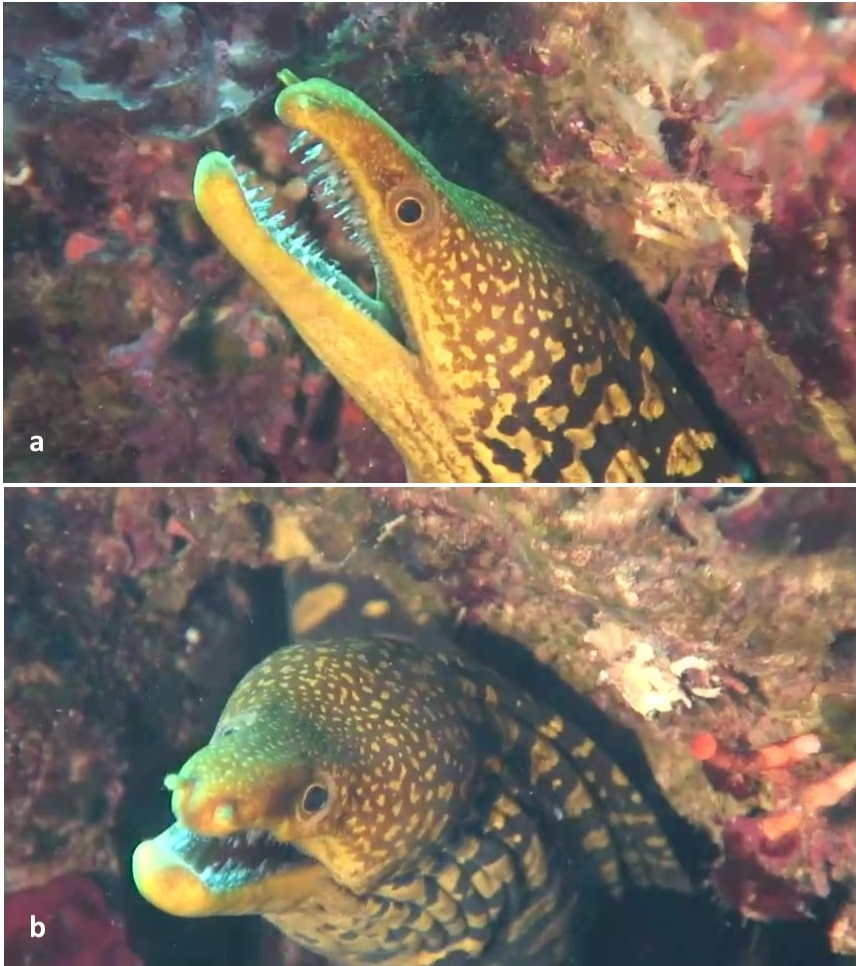
Figure 2a and b. Photographs of the specimen of Enchelycore anatina at the Bay of Alghero (Sardinia – Italy), with distinctive arched jaws, typical to this species