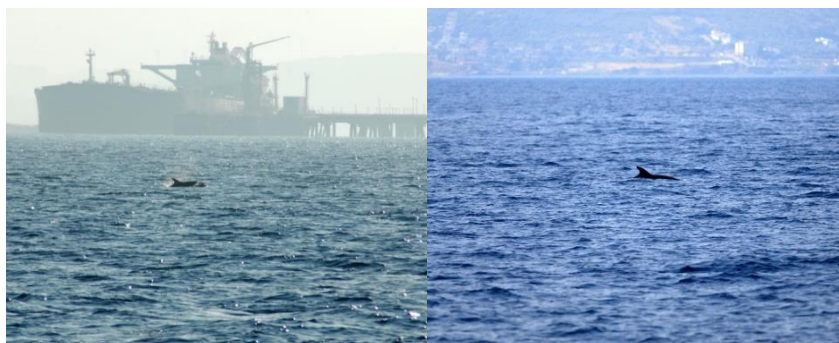
Figure 3. Encountered bottlenose dolphins T. truncatus on 14 December 2015 (left) and 26 June 2016 (right)