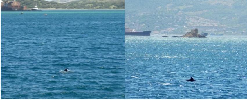
Figure 4. The photographs of the bottlenose dolphins on 8 May 2015 in Nemrut Bay

On 13 and 14 June 2015, two additional opportunistic sightings of T. truncatus - groups with 3 and 10 individuals - were made in Nemrut Bay. Both observations were made in the afternoon (at 15:35 and 18:00). In the former case (38.772719° N - 26.916126° E), the group was swimming towards in-shore, while in the latter case (38.779564° N - 26.908190° E) towards off-shore.