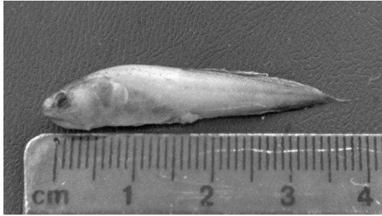
Figure 2. Bellottia apoda (MSM-PIS/2009-2) 35.6 mm SL, from Iskenderun Bay.