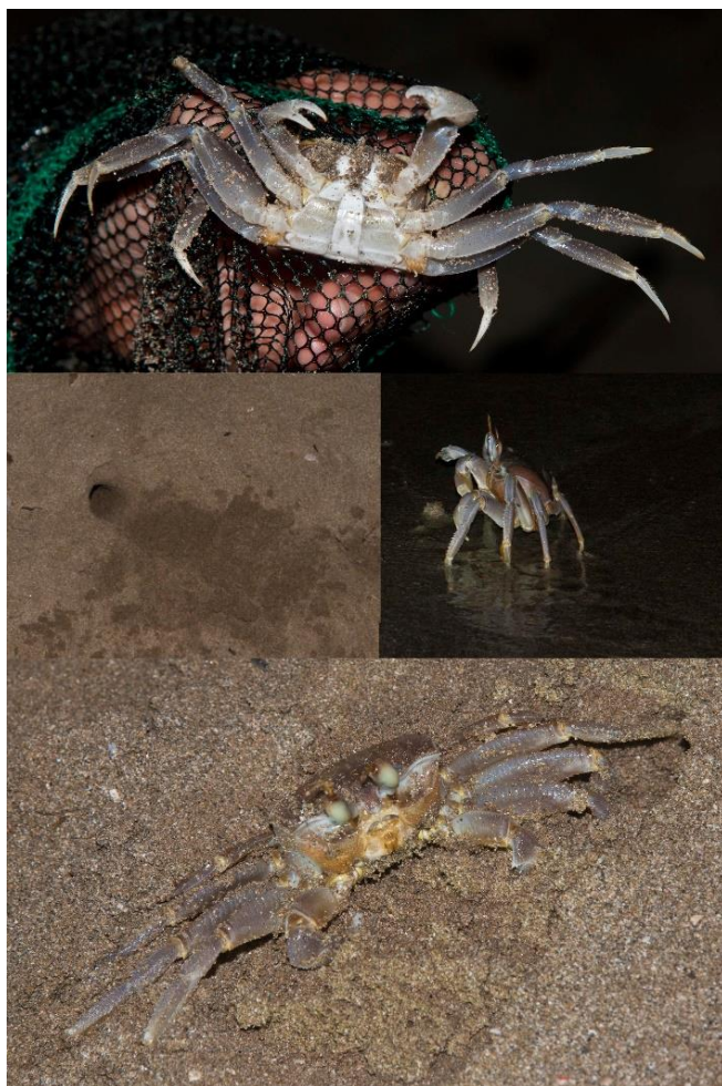
Figure 2. Photos of some specimens and a burrow

All the captured specimens showed the typical characteristics of O. cursor , as reported previously, especially in terms of the shape of the carapace, which was quadrangular, and the typical tufts of bristles above the eyes. This characteristic, in particular, allows to distinguish O. cursor from other species of the genus Ocypode (Sakai and Türkay 2013; WORMS 2020).