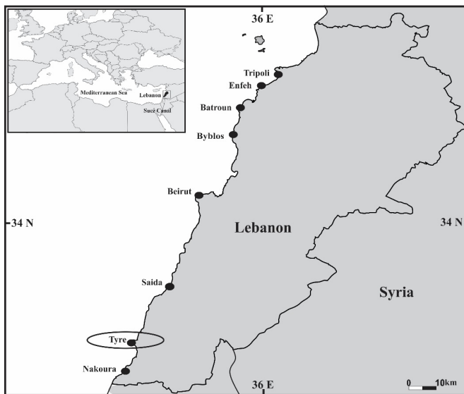
Figure 1. Location where Acanthurus sohal was captured in Tyre, southern Lebanon

A specimen of A. sohal was caught by spearfishing, on 29 April 2021, at a depth of 5 m off Tyre (33°16'19.01"N; 35°11'27.52"E, Figure 1). Photo and video of the captured specimen were sent by the fisherman (BK) and the professional diver (HN) to one of the authors (AB).