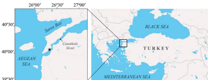
Figure 2. Map showing the observation locality of Aetomylaeus bovinus individual at Çanakkale Strait

1A), and front margin interrupted under eye and not joining with subrostral lobe (Figure 1B). Moreover, the brown dorsum with pale blue-grey transverse streaks is also evident, which is a unique coloration of the species (McEachran and Capapé 1984). Although a special effort was not made by the skin diver for the length estimation of A. bovinus from Sea of Marmara, he indicates a large sized fish with of at least ca. 120 cm DW, probably showing that the individual is an adult.